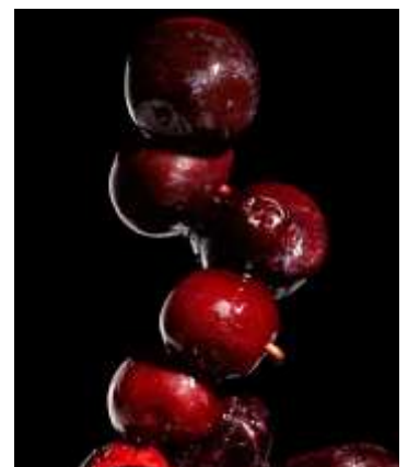
Kea plums