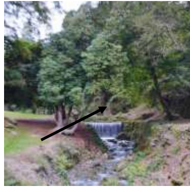
At tip of arrow

About half a mile from St. Austell there is an enclosed well of remarkably pure water, known as Menacuddle Well, i.e., maen-a-coedl, the hawk's stone; and also the remains of its little chapel or baptistry. The chapel is 11 feet long, 9 feet wide. There are north and south doorways, 2 feet 9 inches wide, and 5 feet high. The spring rises on the east side, and the basin, is divided by a stone bar. Its romantic situation moves us more than any idea of the virtue of the water. It is also a wishing well.