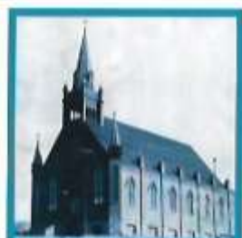
St. Lawrence Church