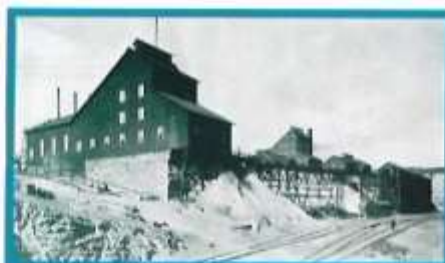
Mountain Con Mines #1 and #2